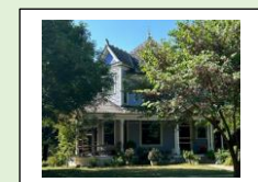
421 E 11 th