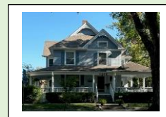
1208 E 9 th

The 6 homes on the porch tour are listed below with their addresses: