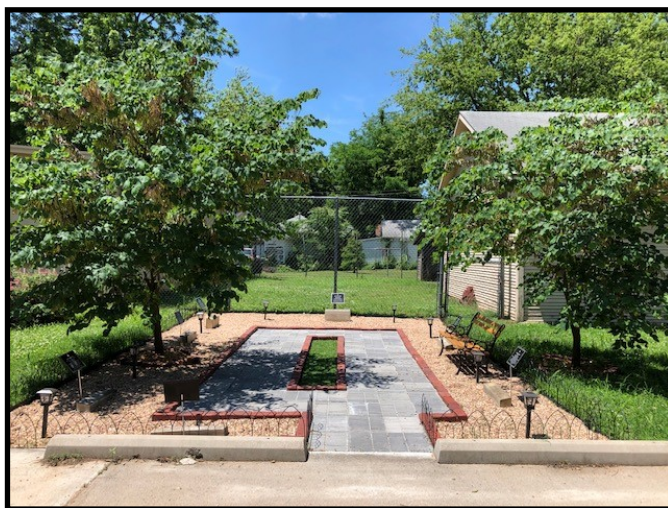
The finished garden is on the west side of the parking lot.