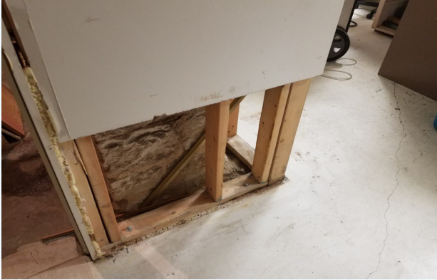
Snapshots of the basement post floods! Construction continues!