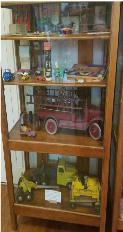
One of our displays in the toy room

I think everyone knows that we are a disposable society. As our new annual display, "Celebrate 150 Years" opens we need to think about the future. In fifty years there will be another celebration planned to celebrate 200 years since Winfield's birth and Cowley County's existence. Will we have anything to display in honor of that event? It is up to you to help us preserve items from now as they are the history that is being made. Please think before throwing anything away whether or not it would be part of history that needs to be preserved. The Cowley County Historical Society is still accepting donations so please think about donating.