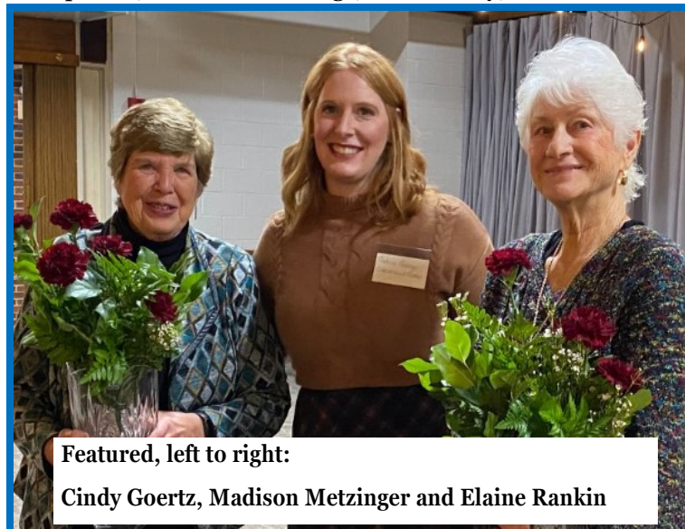
Featured, left to right: