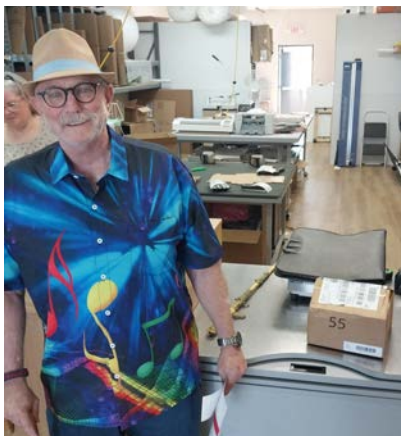
Local Mason sends artifacts to Texas Grand lodge for display.