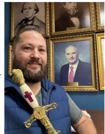
Masonic Artefacts with the Grand Secretary of Texas