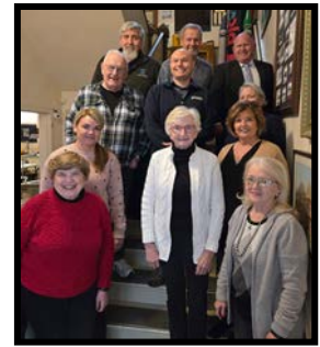
CCHSM 2025 Board Members